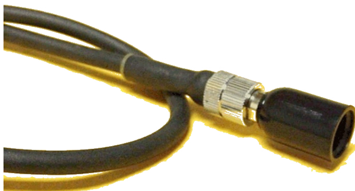
TT-MINI-PROBE connected to a TT-MLC-MC leader cable